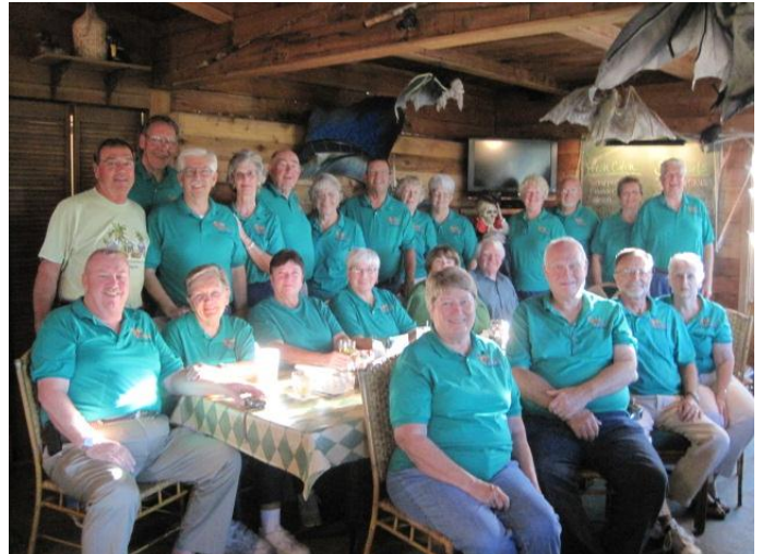
Vagabonds at St. Augustine's Creekside Dinery, 21 Oct 11